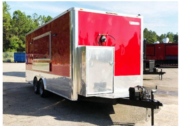
Exterior Photo of Proposed Mobile Kitchen

This grant will allow the purchase of a mobile, self-contained kitchen trailer unit to provide meals in communities affected by a disaster. Over 130,000 meals have been served in the Gulf Coast region. The mobile kitchen will benefit smaller communities in need that are often overlooked by larger organizations. When serving, Forged by Fire Services strives to connect local LCMS congregations within the communities and shares the mercy and grace of Christ, one plate of food at a time.