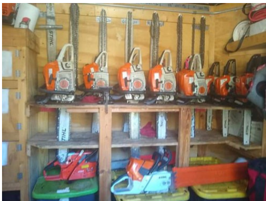
Fully Stocked Equipment Trailer

TLC DRT’s equipment and trailers are also used by volunteers from other teams, causing additional wear and tear on equipment. This grant will allow the repair and replacement of necessary equipment so the team can continue to be Christ’s hands and feet and share God’s love with people affected by disasters.