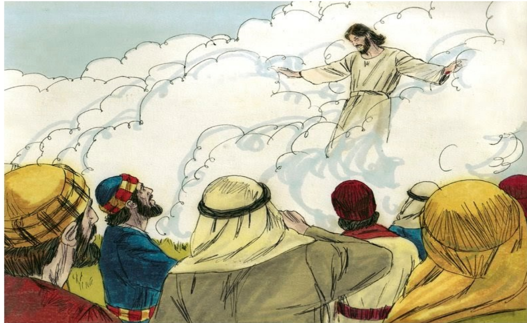
Celebration of the Lords Ascension, May 18, 2023 "This Jesus, who was taken up from you into heaven, will come in the same way as you saw him go into heaven." Acts 1: 11b