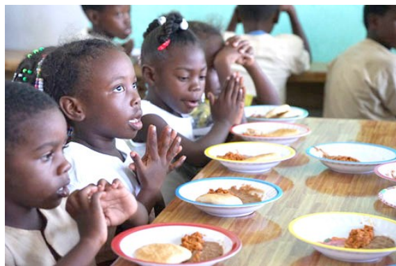
Children in the program begin their meal with prayer and thanksgiving.

This grant of $100,000 is paid in full. Praise the Lord for the generous gifts through our mission Mites.