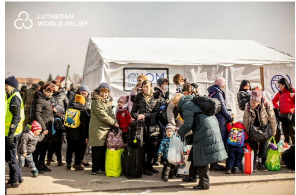
Above: Mdyka Border Crossing bottom previous column: Przemsyl School Refuge Shelter.