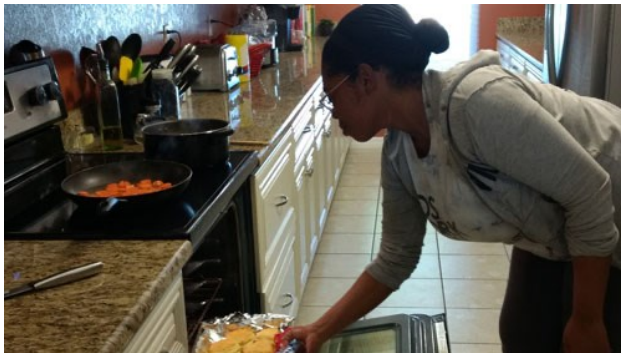
Each woman cooks at least one night a week.