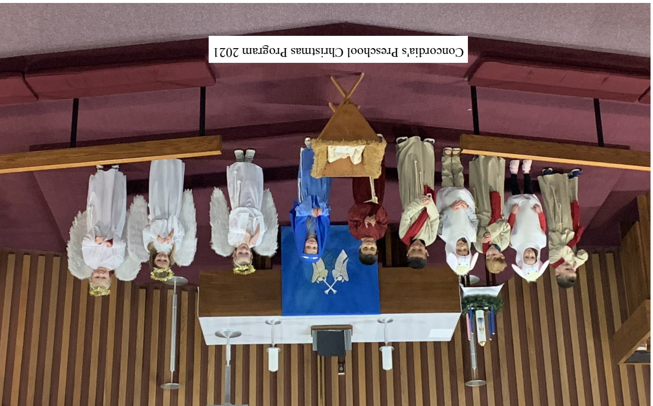
Concordia's Preschool Christmas Program 2021

Concordia Lutheran Church & Preschool 305 N Howard Road, Greenwood, IN 46142