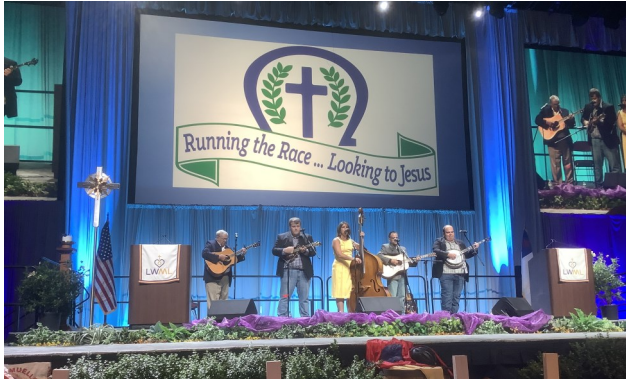
Entertainment held on Saturday night at convention