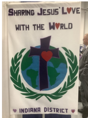
Indiana's banner for the 2021 National convention

to us and our response to Him. When possible, facts about the author will also be included. So mark October 8 & 9 on your calendar and plan on going to Camp Lakeview.