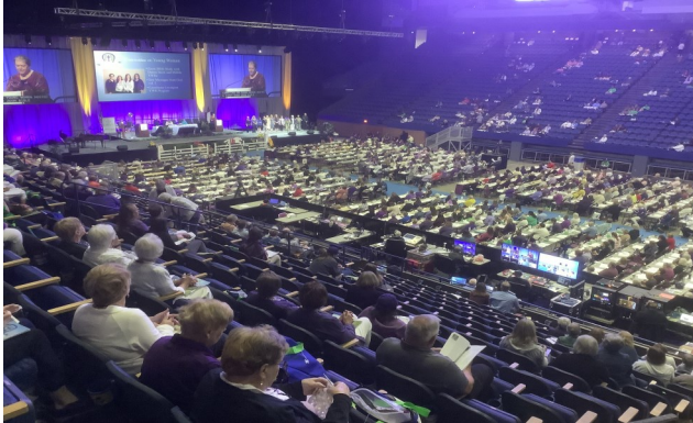
Large Grant #8 (LWML Indiana Virtual Convention 2020)

Statistics might give a picture of the convention, but the Bible studies, mission speakers, servant events, special lunches, Saturday evening entertainment, singing, hugs, and laughter are what everyone who attends remembers the most.