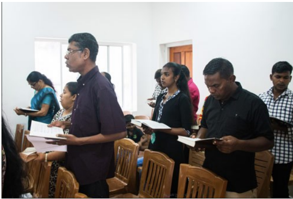
Immanuel Lutheran Church congregation at worship on Sunday morning

Large Grant #2 (LWML Indiana Virtual Convention 2020)