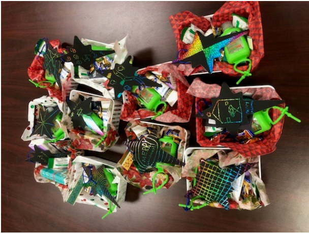
Baskets all made up with ornaments made for home bound by the Sunday school.