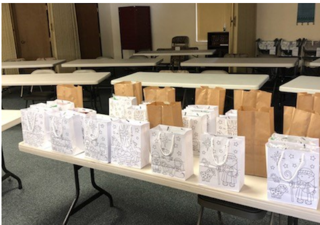
Activity bags for Jesus' Birthday celebration.